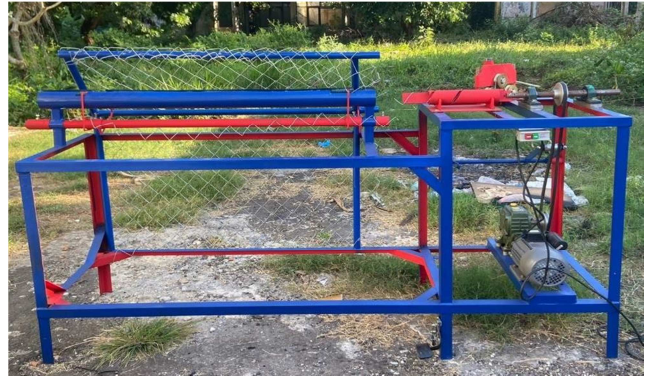
Figure 3. Harmonica Wire Forming Equipment Products.

the harmonica wire mold will be bent by the wire bending plate. The bending plate is driven by an electric motor, then press the push button on the power generated from the electric motor will be forwarded to the gearbox using a fixed clutch , the power coming out of the gearbox will rotate the pulley and then the pulley will rotate the V-bell. When the pedal is pressed it will pull the alternating towards the tensioner, then the tensioner will press the V-bell, the pressed V-bell will rotate .